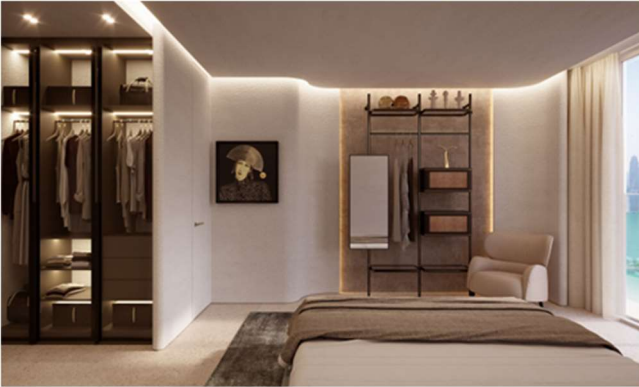
An example of bedroom

Residences, we have recently secured two additional major projects—one in the Middle East and one in Central America—both currently under confidentiality agreements."