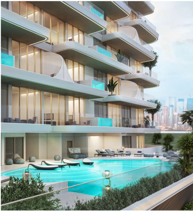
Natuzzi Harmony Residences: pool and amenities

Dubai, November 12, 2024 – Natuzzi S.p.A. (NYSE: NTZ) presented its first branded residential project, the Natuzzi Harmony Residences (the “Project” hereafter) with a ceremony at the “Coca-Cola Arena” attended by over 1000 selected guests.