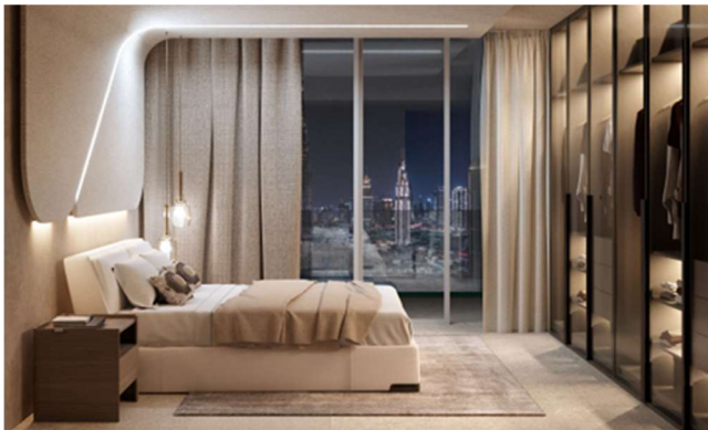
An example of bedroom