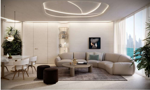
An example of living room

This Project marks a significant milestone for our business across three key dimensions: