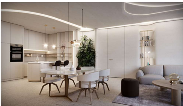
An example of living & dining room